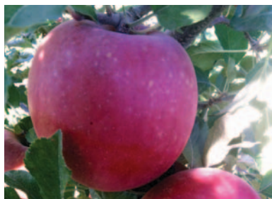
Fuji Supreme™ (Cabp cv.)

This is a Braeburn x Royal Gala cross with good productivity. Harvest starts similar to slightly earlier than Royal Gala. Fruit is differentiated by elongated shape and sweet, rich taste. Texture after storage is similar to Royal Gala. This selection is licensed by Prevar. USPP#19,762.