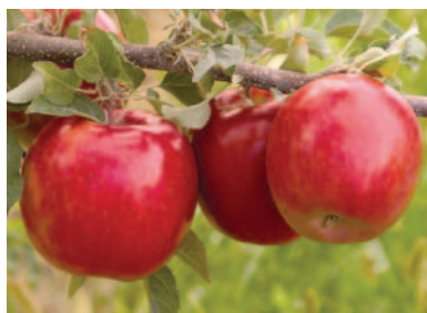
Morning Mist™ Fuji (Fugachee cv.)

This is a new and distinct spur-type apple tree notable for its compact tree type, spur bearing habits, and high productivity compared to Cripps Pink and other known sports.