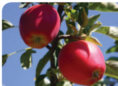
Sweetie™ (Prem1A cv.)

This is a Braeburn x Royal Gala cross with good productivity. Harvest starts similar to slightly earlier than Royal Gala. Fruit is differentiated by elongated shape and sweet, rich taste. Texture after storage is similar to Royal Gala. This selection is licensed by Prevar. USPP#19,762.