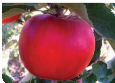
Royal Crimson® Topaz (Tupy2 cv.)

Cherry Gala is a sport of Royal Gala. It is a cherry-red colored apple with striping that matures slightly ahead of Royal Gala. This apple has a crisp, full flavor, and a striking appearance.