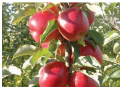
Pink Lady® (Pflogg cv.)

A new early maturing selection of Cripps Pink. The fruit matures a good three to four weeks ahead of the standard Cripps Pink. All other tree and fruit characteristics appear to be the same as the original variety.