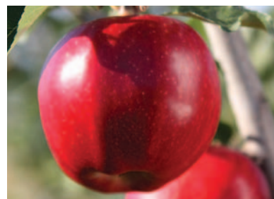
Cherry™ Gala (Burkitt cv.)

Morning Mist Fuji is an early maturing sport of Fuji that ripens ahead of standard Fuji. This variety has a creamy white flesh and sweet flavor similar to standard Fuji. The color pattern is a bright-red finish with a thin striping pattern that, in high-coloring areas, might cover over.